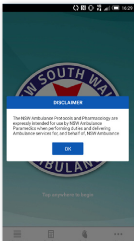
1) Opening Screen